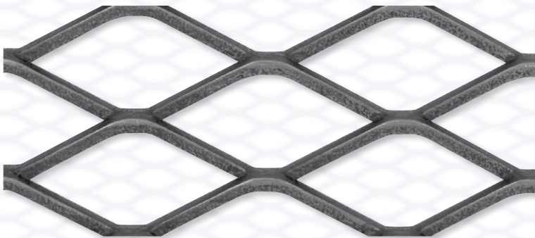
Ref No. 50-89

A heavy duty raised security mesh suitable for internal or external brickwork and can act as a key for render or plaster finishes when galvanised.