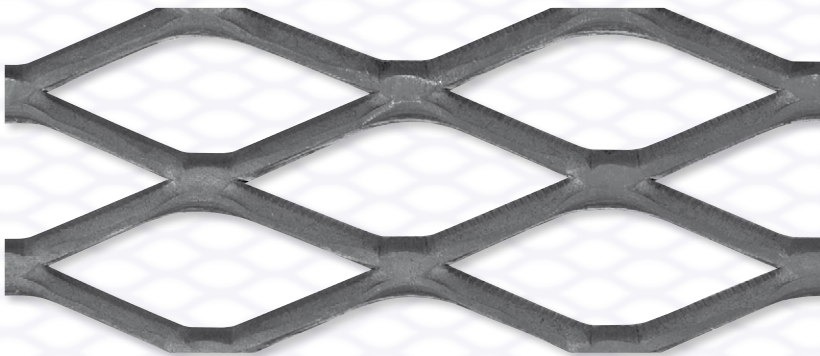
Ref No. 50-73F

A heavy duty security mesh suitable for internal wall security, partitions, ceilings and roofs.